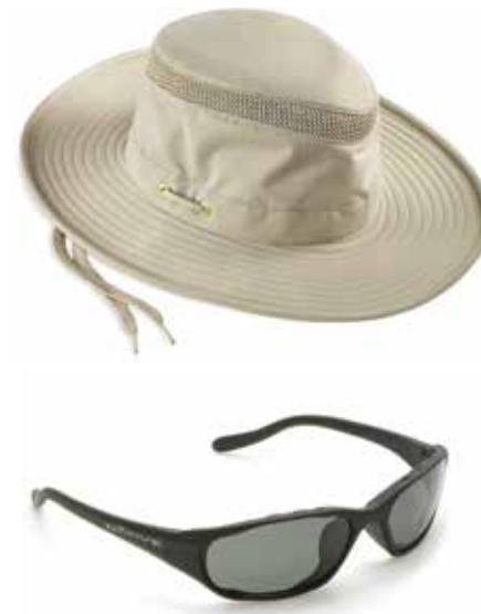
Cover your head from the sun (and rain) with Tilley's LTM6 Airflo hat; and protect your eyes with sleek shades from Native Eyewear. $79–$159