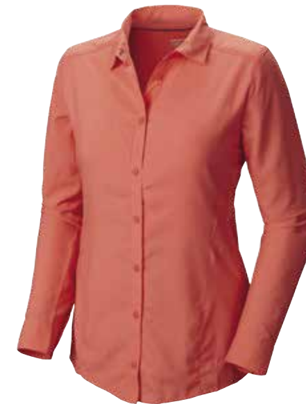
Mountain Hardwear's Canyon Shirt will keep you cool on trail while protecting you from harmful UV rays. M/W $65