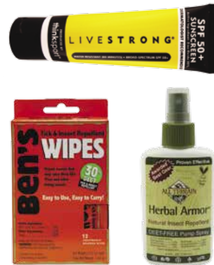
Protect yourself from the sun and annoying insects with one of these trail-tested and team-approved sunscreens and insect repellents. $6–$13

Many of the things that should be considered when you venture outdoors should already be on you or in your pack if you're carrying your Ten Essentials. Here are some reminders—as well as a few other suggestions—to help ensure you have a safe and enjoyable time on the trail and that you are prepared to respond properly in the event of an injury or emergency.