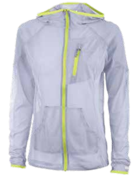
Don't stay indoors. Get out, and keep the bugs off, with Columbia's lightweight Insect Blocker Mesh Jacket. $90